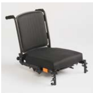
Firm seat unit Padded robust seating. Cross compatible with the well known Spectra Plus seat.