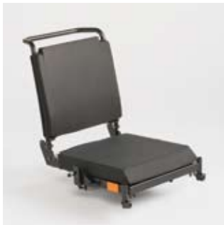
Standard seat Features tension adjustable backrest for individual support.