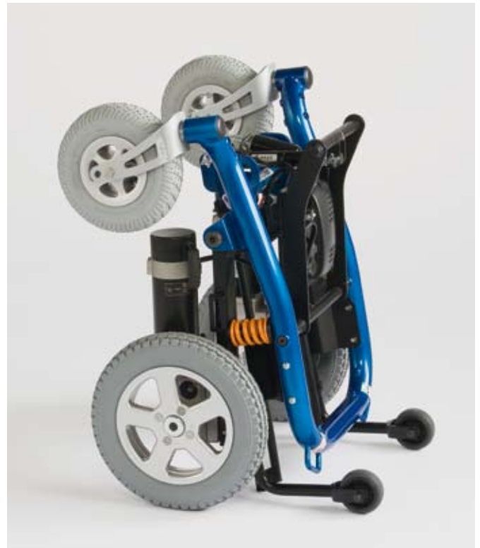
Swing out anti tippers A useful feature for storing the wheelbase.