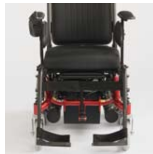
Narrow width The total width with the option of small castors is below 59 cm.