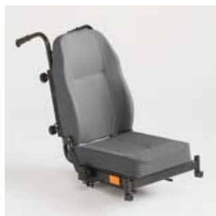
Flex II seat A comfort style seat supporting good posture. Cross-compatible with the well known Rea ™ seat.