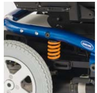
Spring for suspension A comfortable drive and safe traction are ensured even at high speeds.